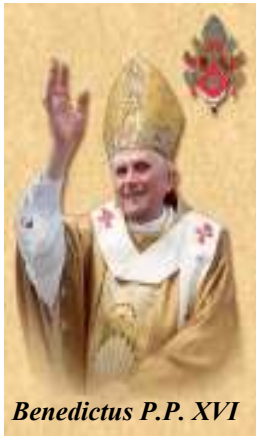
Benedictus P.P. XVI

The Santa Rosa Parish congratulates Pope Benedict XVI on the 5th anniversary of his Pontificate and we continue to pray for God's special grace and guidance on him as he serves the universal church in these challenging times